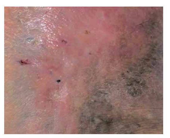
Figure 5. Complete recovery leg ulcer 36 × 40 mm